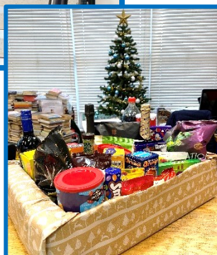
Last year's festive hamper. Yummy!

As a thank you, and to spread a little holiday cheer, for every £5 you donate, the FSA will put an entry with your name on it into our Christmas Hamper Draw ! Our hampers are filled with seasonal goodies and are a great way to start the holiday season, so don't forget to add your name on any GoFundMe donations if you want to be in with a chance of winning it! We really appreciate every single donation – thank you for your support.