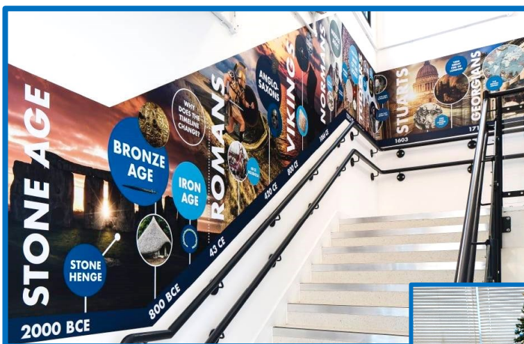
Example photo of wall art (not the actual design).

We know that this is a particularly difficult time financially for most people and want pass on our sincere thanks to anyone considering donating.