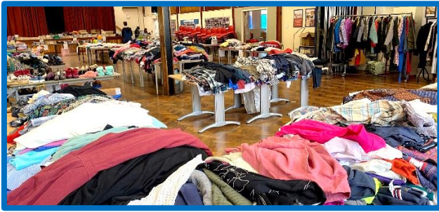
Fitzharrys' Giant Jumble Sale 2023

Yes, we know this happened a few months back, but we still can't believe that our last Giant Jumble Sale fundraiser – held on Sunday 29 th January – raised over a whopping £2100!! That's the most that any FSA event has ever raised, and a full £1000 more than our last Jumble Sale!