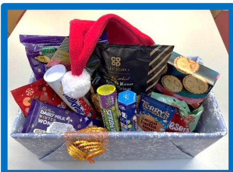
Our 'runner-up' hamper – kindly donated by the Co-op

As this newsletter went to press, the total raised via GoFundMe currently stands at £662! We would love to reach £750 (3/4 of our GoFundMe target) before Christmas... can you help us get there by donating, or sharing our fundraiser online?