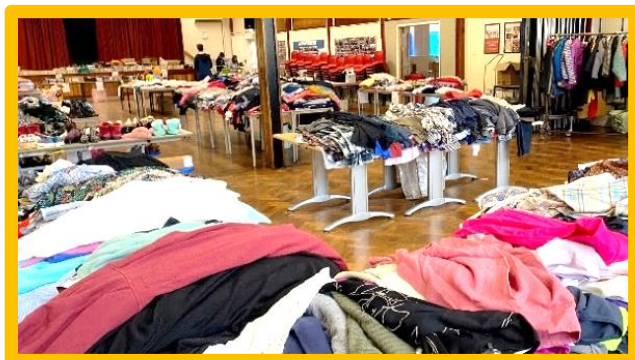
Fitzharrys' Giant Jumble Sale 2023

The FSA will be holding another Giant Jumble Sale at Fitzharrys School on Sunday 28 th January, 10am-12pm. Last year, this event raised over a whopping £2000 – an FSA record – and we would love your support to make our 2024 sale another huge success!