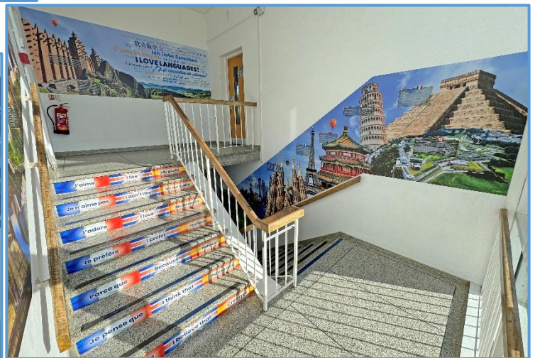
Modern Foreign Languages (MFL) department

It has been an absolute joy to witness the delight of students, staff, and guests when they visit these areas.