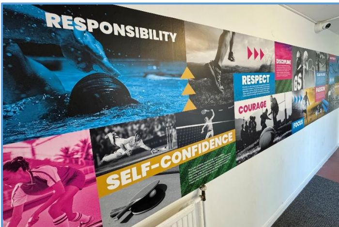
Gym & Fitness Suite

It was fantastic to have these designs mounted right before the recent school Open Evening, where visitors enjoyed viewing the wall art on their school tours.